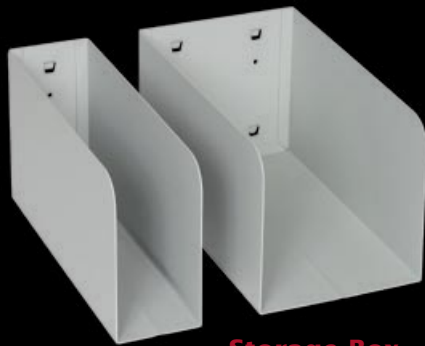
Storage Box 3" & 6"