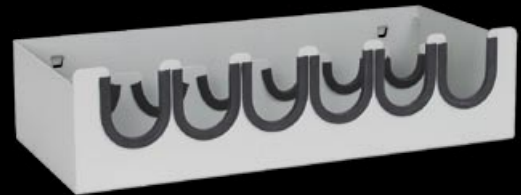
Hand Gun Pac 6 & 8 capacity