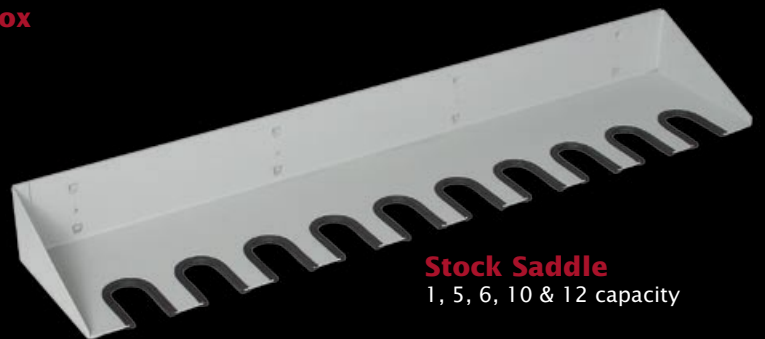
Stock Saddle 1, 5, 6, 10 & 12 capacity