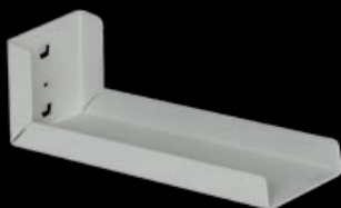
Stock Shelf 1, 5 & 6 capacity