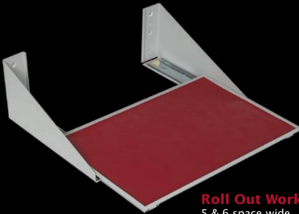
Roll Out Work Shelf 5 & 6 space wide